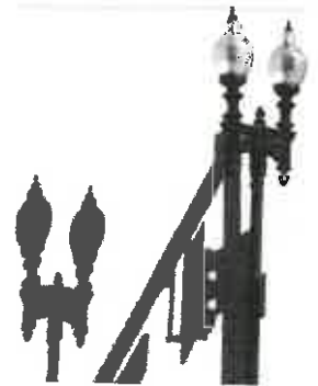
"Lamp" by Raven Goodell