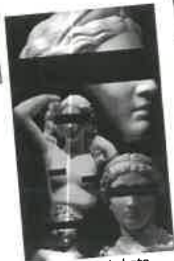
Unnamed photo by Lauren Dow