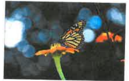
Unnamed photo by Sara Del Rio Vazquez