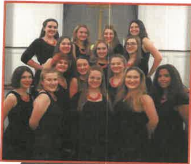
Wells High School's Select A Cappella Chorus