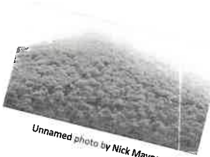
Unnamed